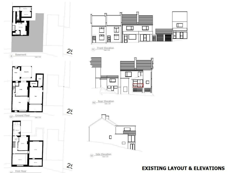
EXISTING LAYOUT & ELEVATIONS